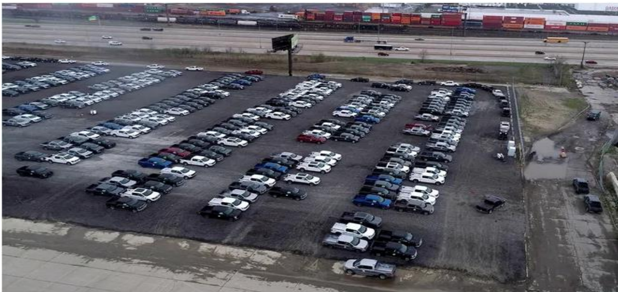
New Ford F-150 pickup trucks sit Thursday in a lot of the Department of Public Works rail yard off I-96 near Evergreen in Detroit. The trucks are waiting for semiconductors, the company said. Trucks will get quality checks done before being shipped to dealers.

Computer chips, a key input for every technology from calculators to tablets to vehicles, face critical shortages. Intel believes these shortages could last several years as capacity is slowly expanded. 3 Meanwhile, producers are feeling the heat from the chip shortage. For example, auto manufacturers have had to idle plants and delay the release of new vehicles due to the lack of available chips; simultaneously, demand for vehicles is soaring.